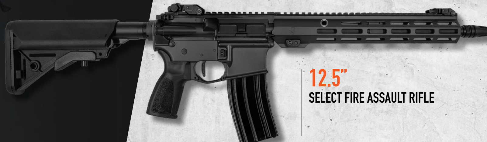
12.5" SELECT FIRE ASSAULT RIFLE