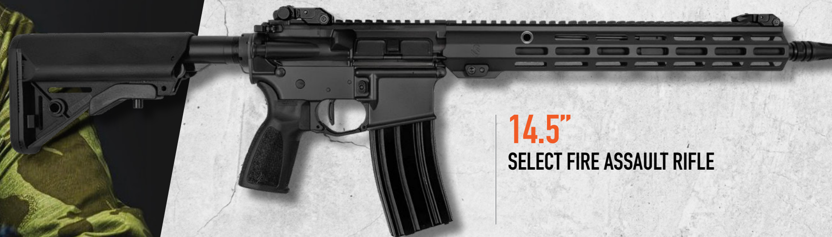
14.5" SELECT FIRE ASSAULT RIFLE