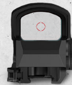
65 MOA RING