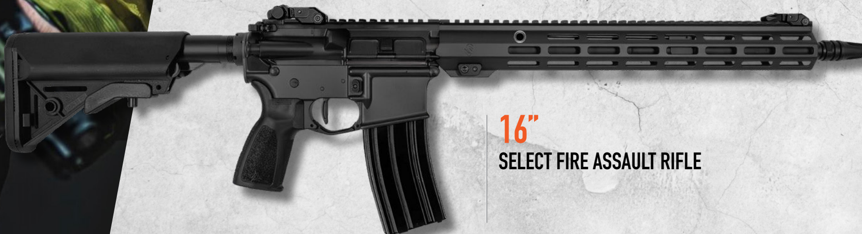
16" SELECT FIRE ASSAULT RIFLE