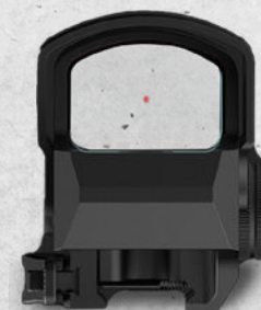
2 MOA DOT