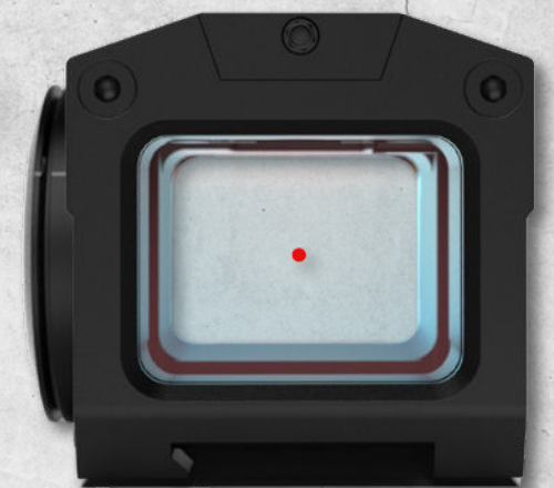
3 MOA DOT