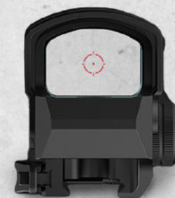
2 MOA DOT + RING