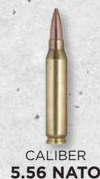
CALIBER 5.56 NATO