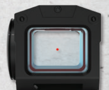
3 MOA DOT