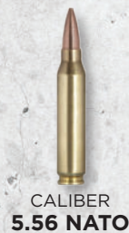
CALIBER 5.56 NATO