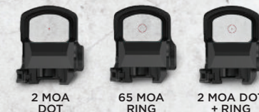
2 MOA DOT 65 MOA RING 2 MOA DOT + RING